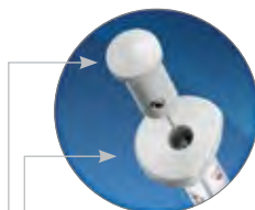
Unique flange design for accurate syringe installation Adjustable button to prevent plunger tip damage