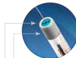
Improved needle hub design for zero carryover Color-coded hub for quick needle volume identification